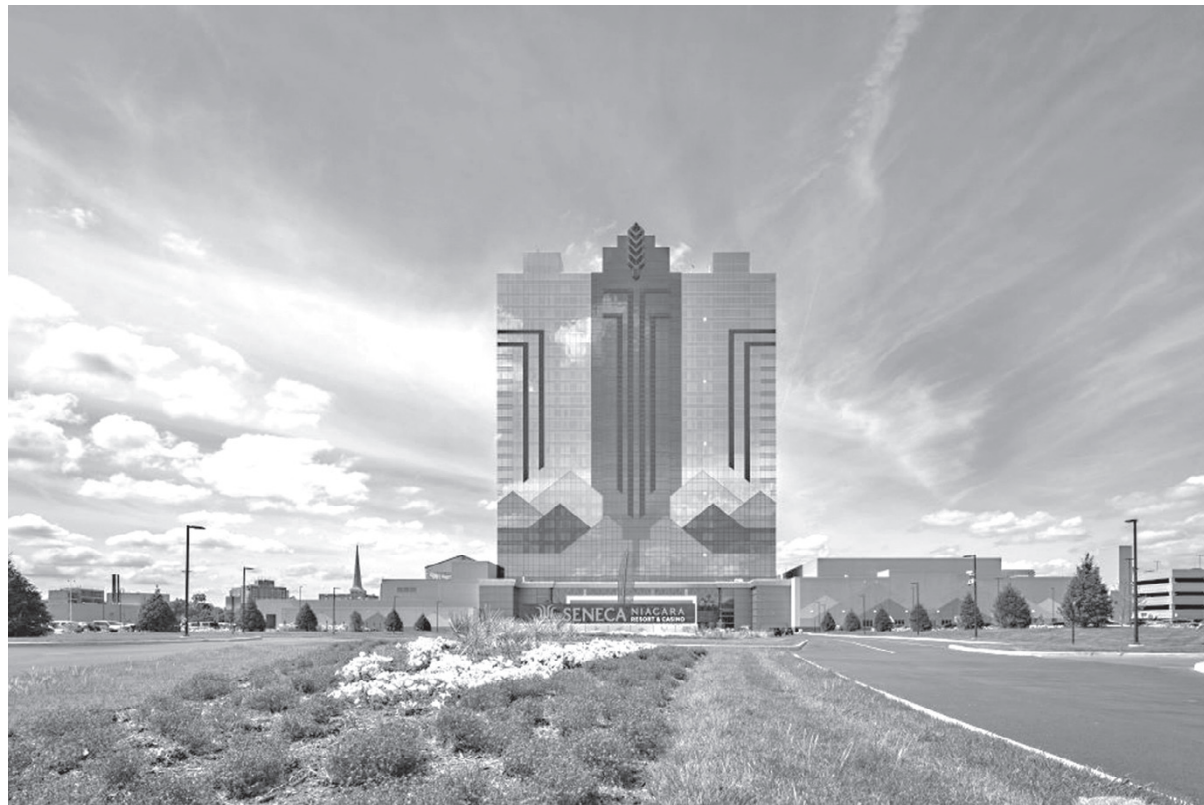
Seneca Niagara Resort & Casino

10Best Readers' Choice Awards for 'Best Casino Outside of Las Vegas'; voting runs until Aug. 28